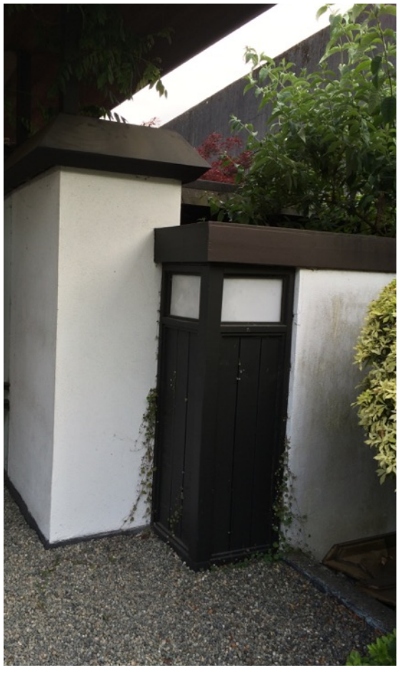
WOOD AND PLEXIGLASS PIERS WHICH ILLUMINATE THE BUILDINGS CORNERS IN THE EVENING