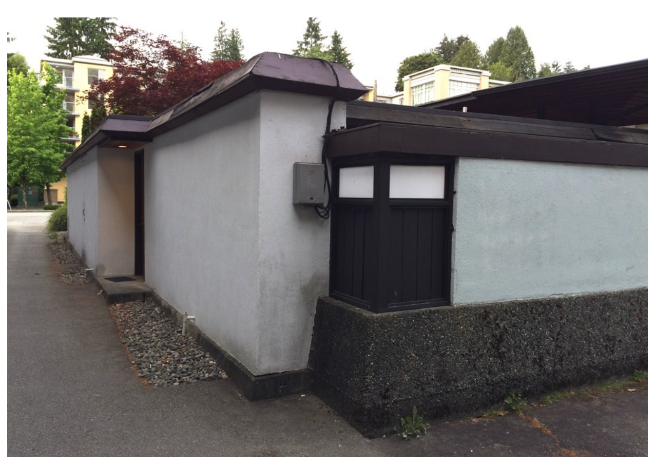
REAR OF THE BUILDING ABOVE: LOOKING NORTH BELOW: LOOKING ACROSS THE REAR NOTE THE CONCRETE SILL UNDER THE WEST WALL