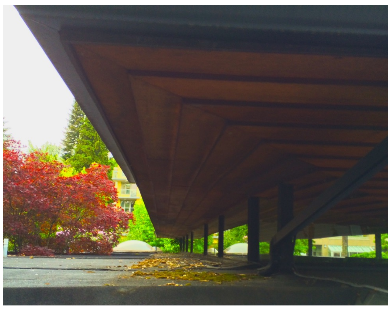
ROOF AND CLERESTORY