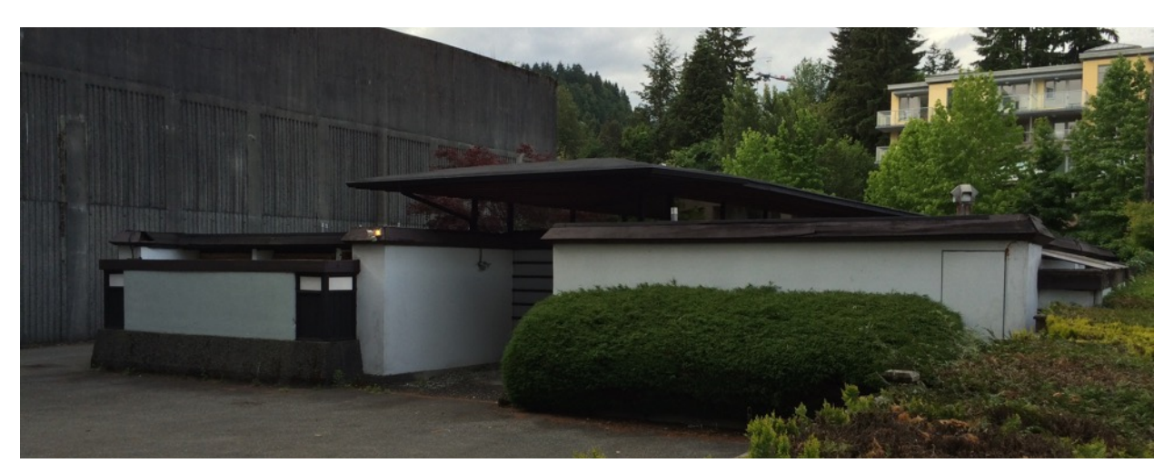
REAR OF THE BUILDING