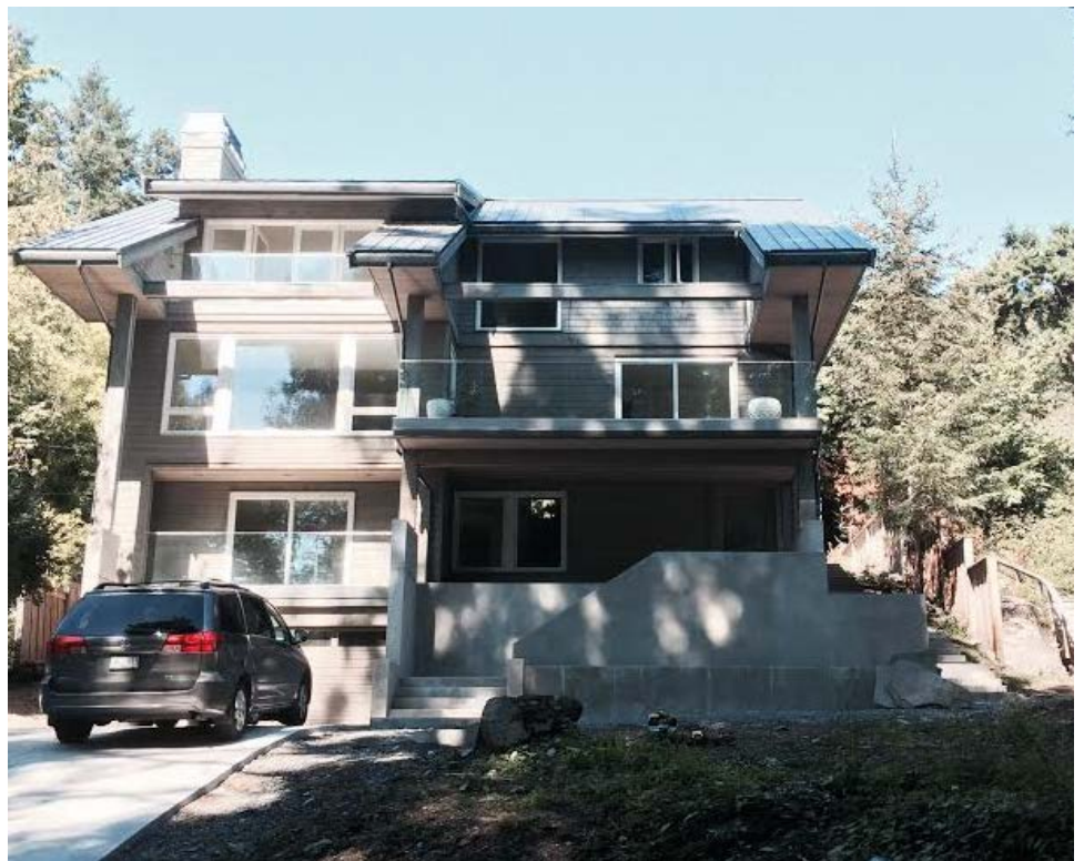
Neighboring homes on Piccadilly South. The new home has been designed to have a similar appearance of existing homes on Piccadilly South.