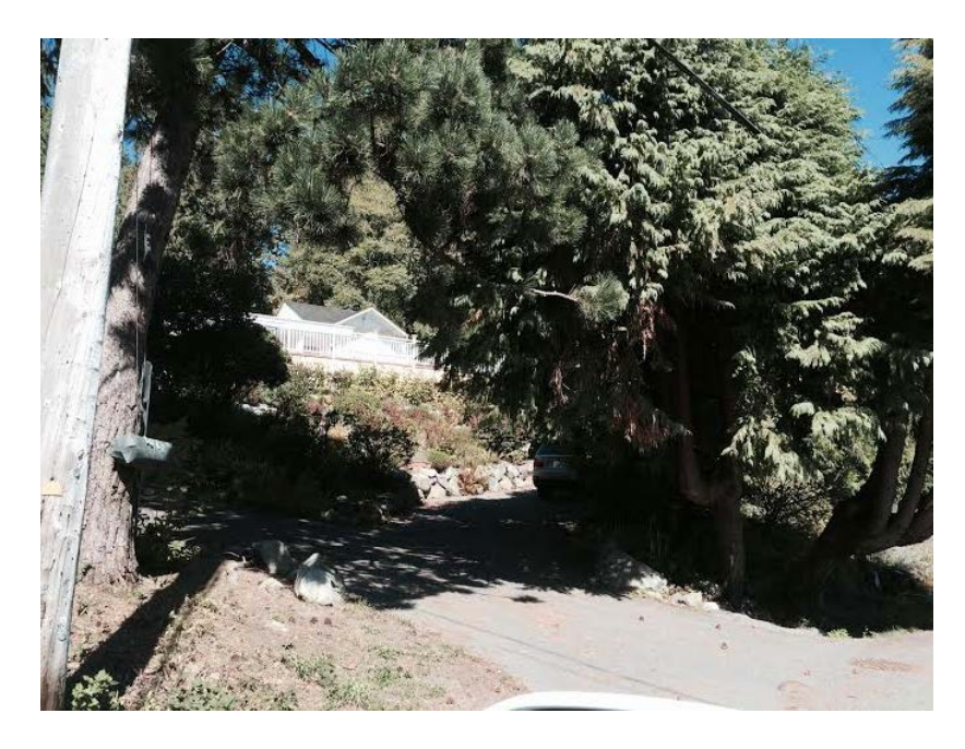
The neighbor directly west of the new home is shown to depict the street view of the home and drive way.