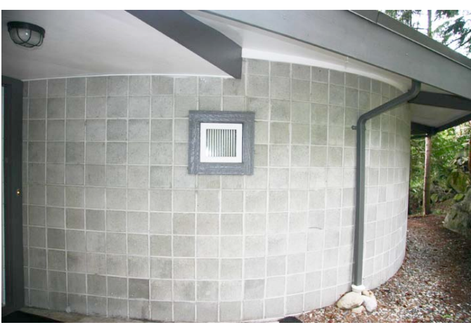
Curved 'Denstone' wall of the library