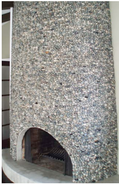
Fireplace of library