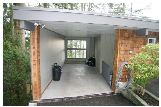
Carport, which is located above living space