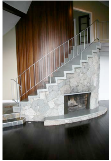
Granite fireplace with concrete stairs above