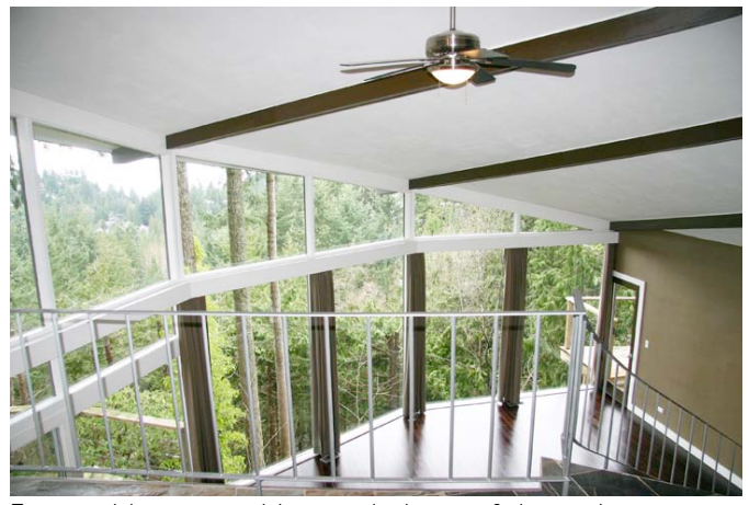
Exposed beams and large windows of the main room