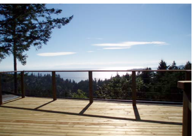
View from the back deck