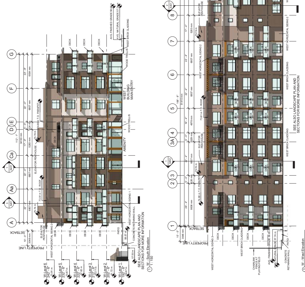
① W. West Elevation 1:150

DATE 21 March 2011 SCALE AT 24x36 SHEET SIZE 1:150 REV. DRAWING NO. A302