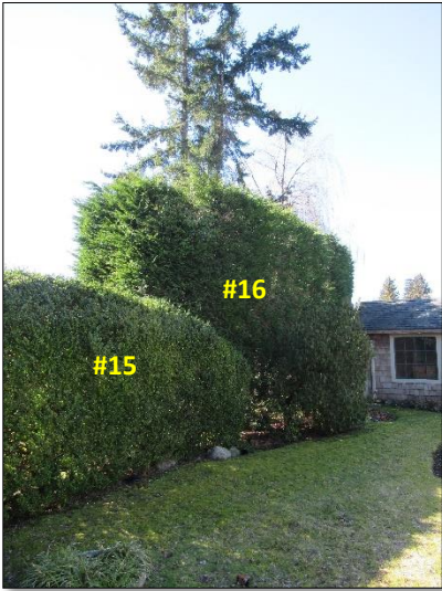
Hedges #15 & #16