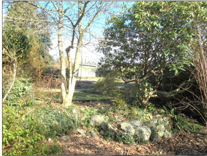
Tree #7 &