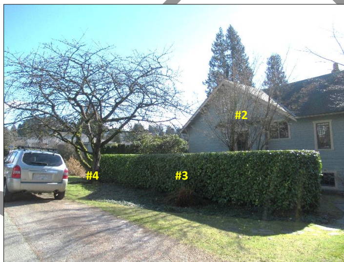
Trees #2 & #4, and Hedge #3