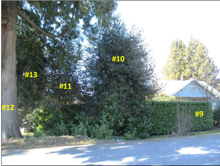
Hedge #9, and Trees #10 - #13