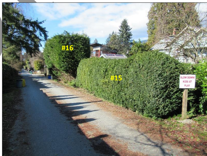
Hedges #16 & #15