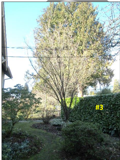
Tree #2 & Hedge #3