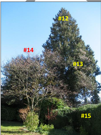
Trees #12 - #14 & Hedge #15