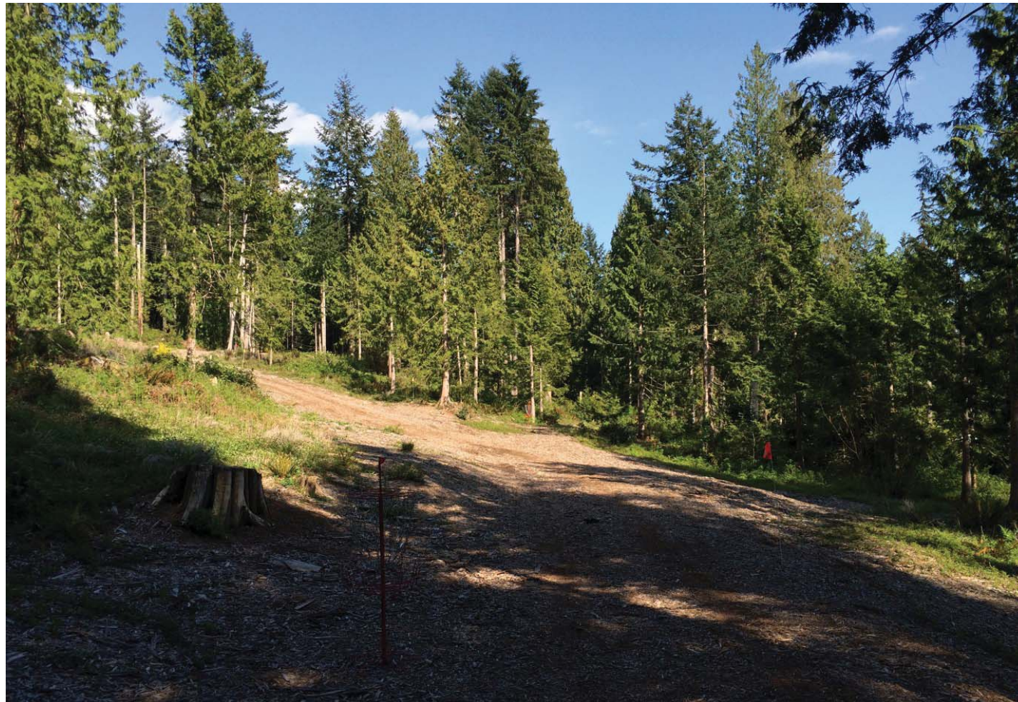
View of Lot 3 looking east

There are a number of non-native species in the ravine. Holly can be found sporadically throughout the ravine, while English Ivy can be found more commonly towards the south end close to previously developed areas off of Skilift Road.