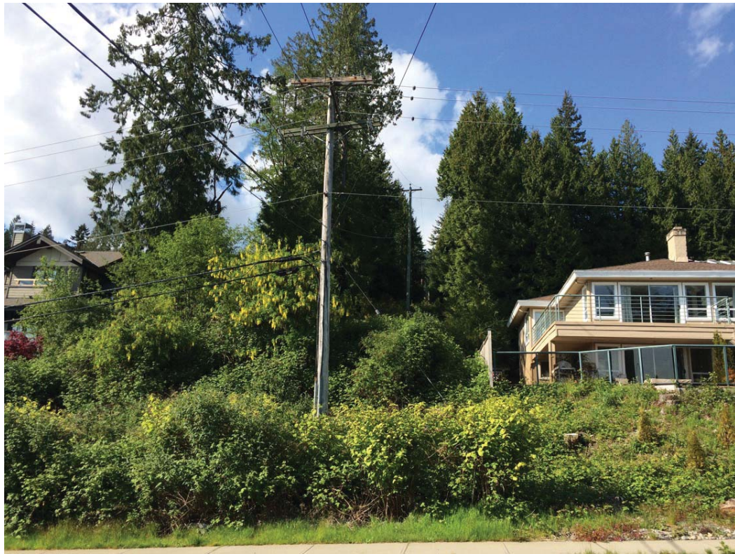
Figure 3 – Unopened Road Allowance from Skilift Road up 25th Street