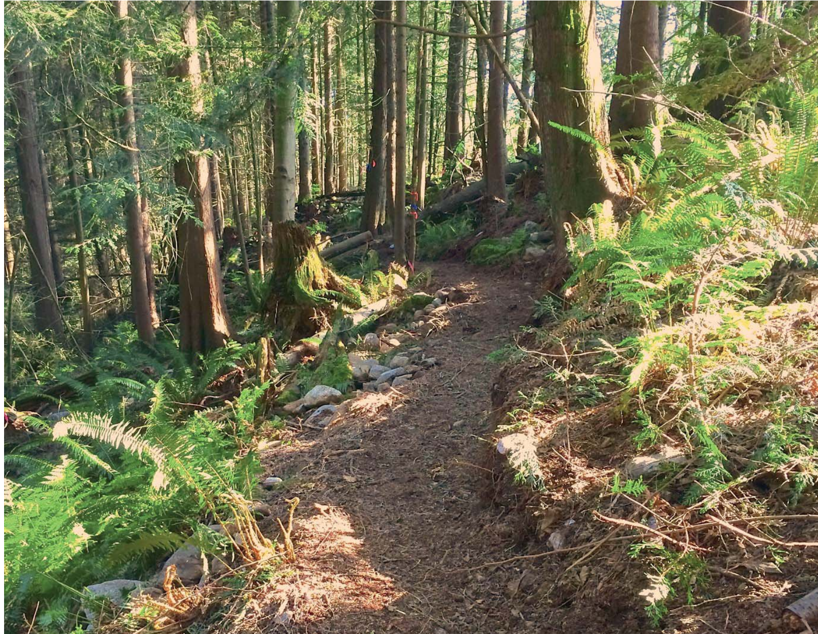
View of the trail on Lot 6 in the Marr Creek ravine

A trail runs through the eastern portion of the property along the ravine about 6 to 8 meters down slope from, and roughly parallel to, the top of the ravine bank. The trail has an average grade of about 20%.