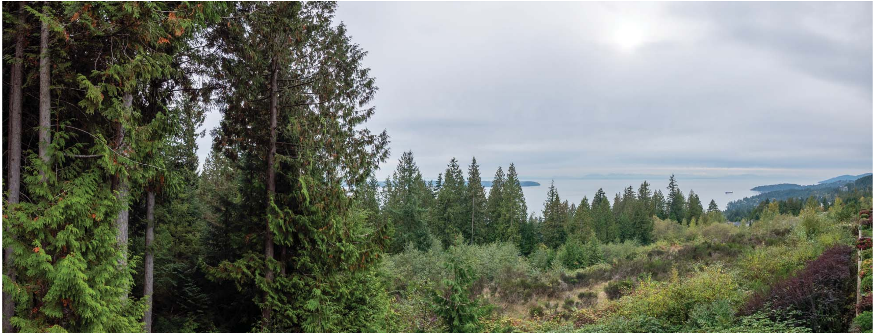
View South - Lot 1 East