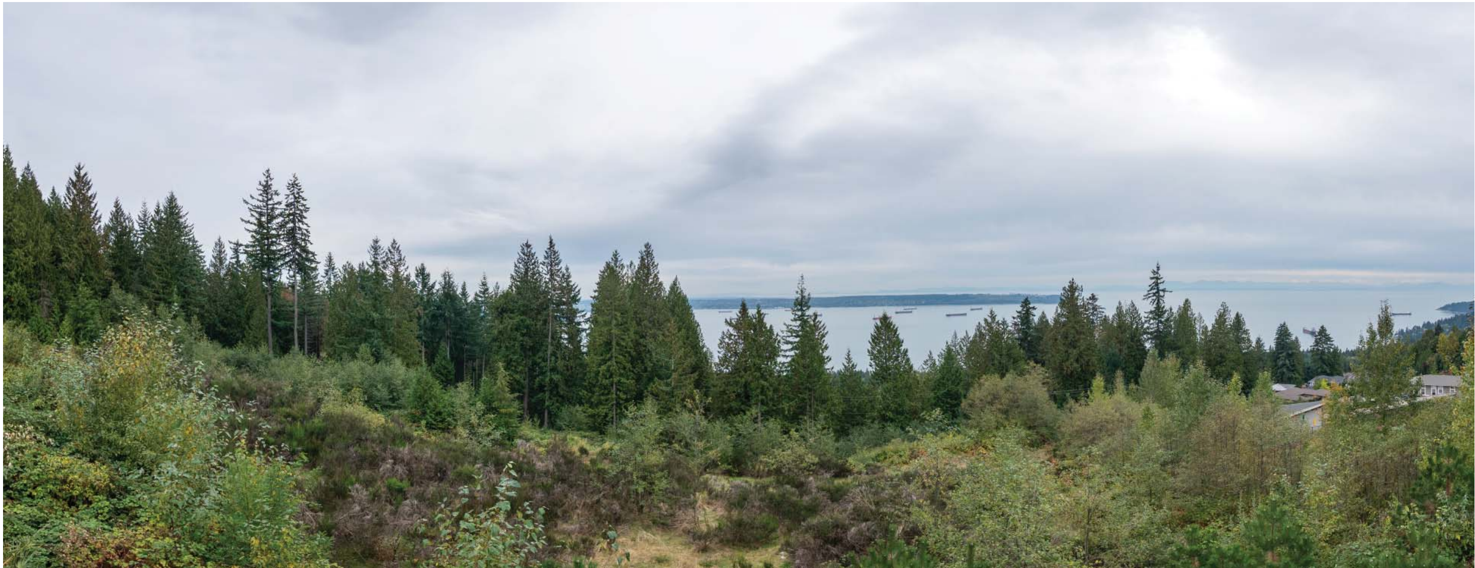
View South - Lot 5 West