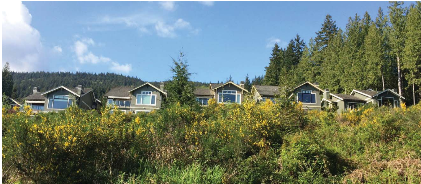
View of Lots B & C (foreground) & the 5 adjacent residences of Marr Creek Court to the north.