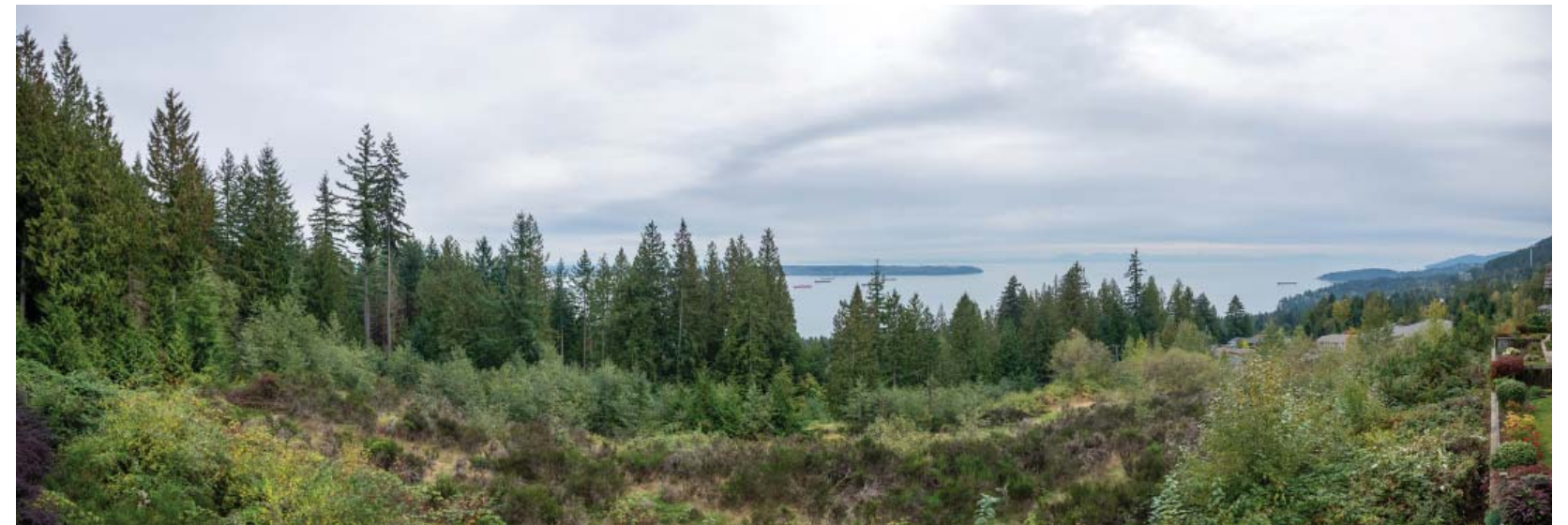
View South over the entire site

There are no buildings currently on the land and there is no evidence that any buildings have existed in the past. A Stage 1 Preliminary Site Investigation Report concludes the land is “low risk” for the presence of contamination with a recommendation that “No further investigation is considered warranted” (refer to Appendix 7).