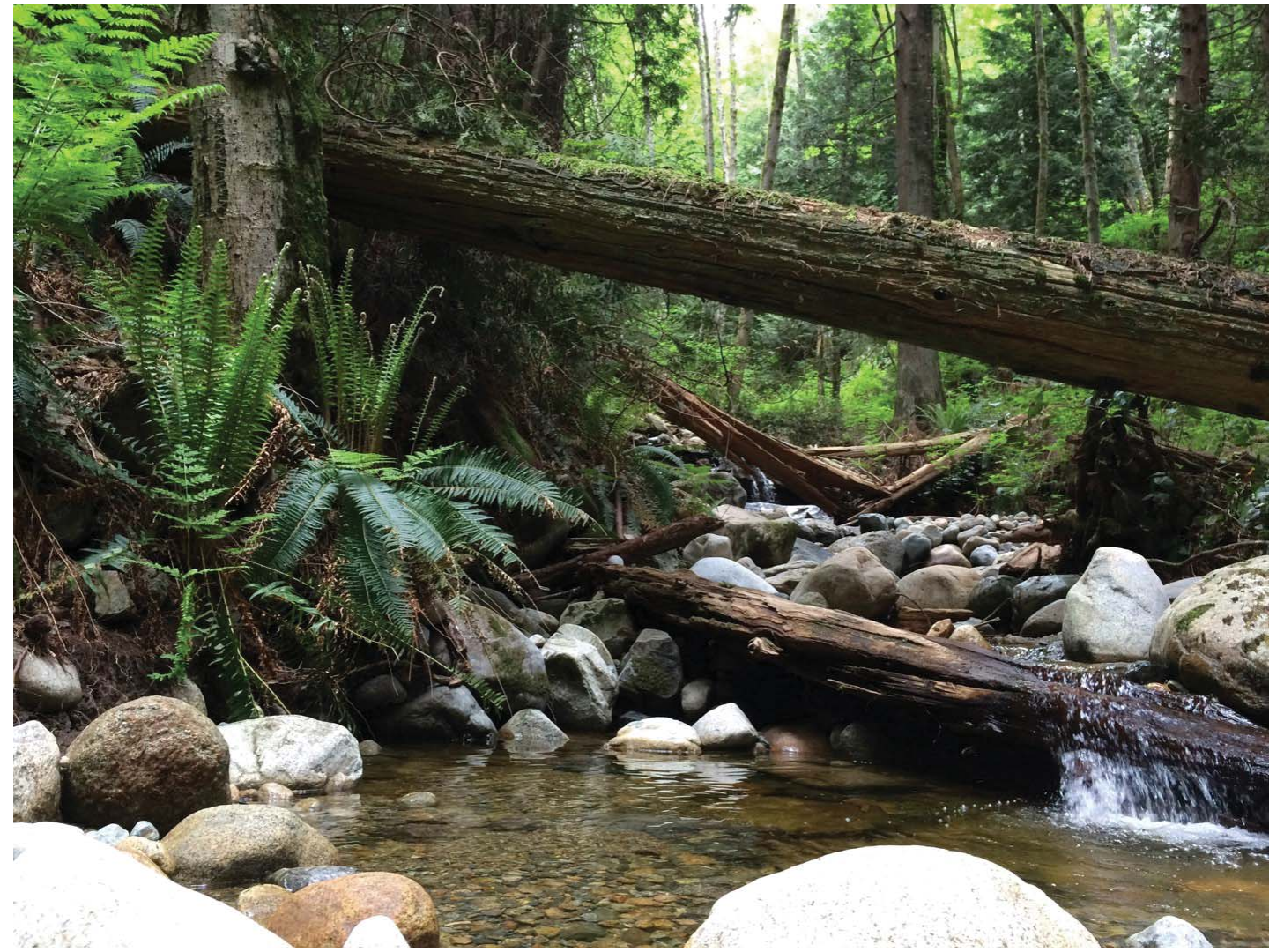
View looking north along Marr Creek