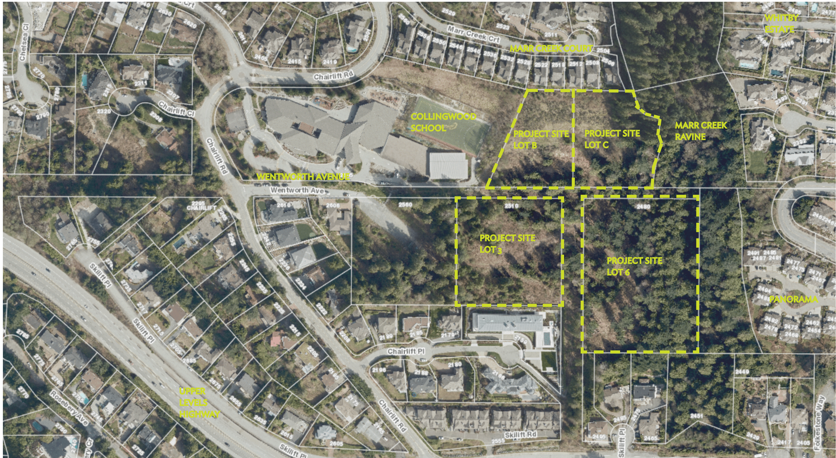
Wentworth Lands in the Neighbourhood Context