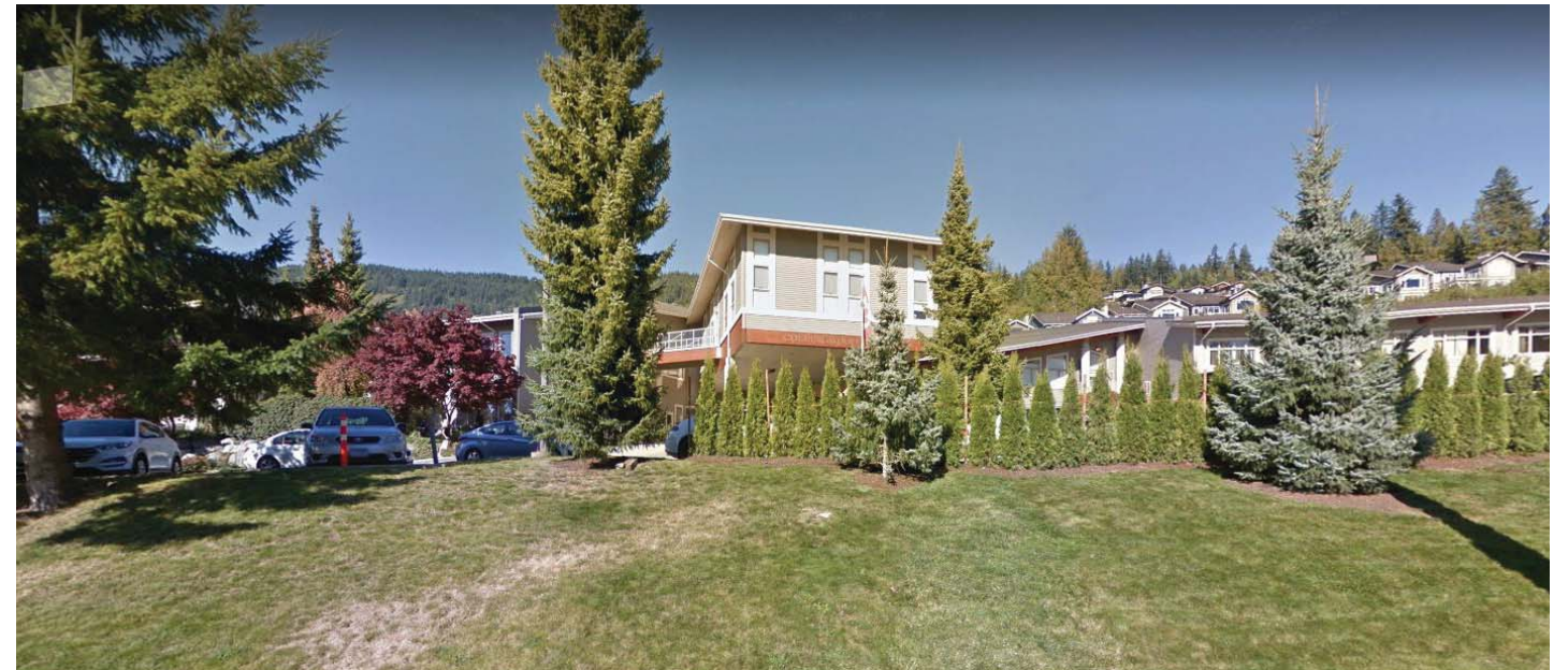
Collingwood School looking North towards the entrance