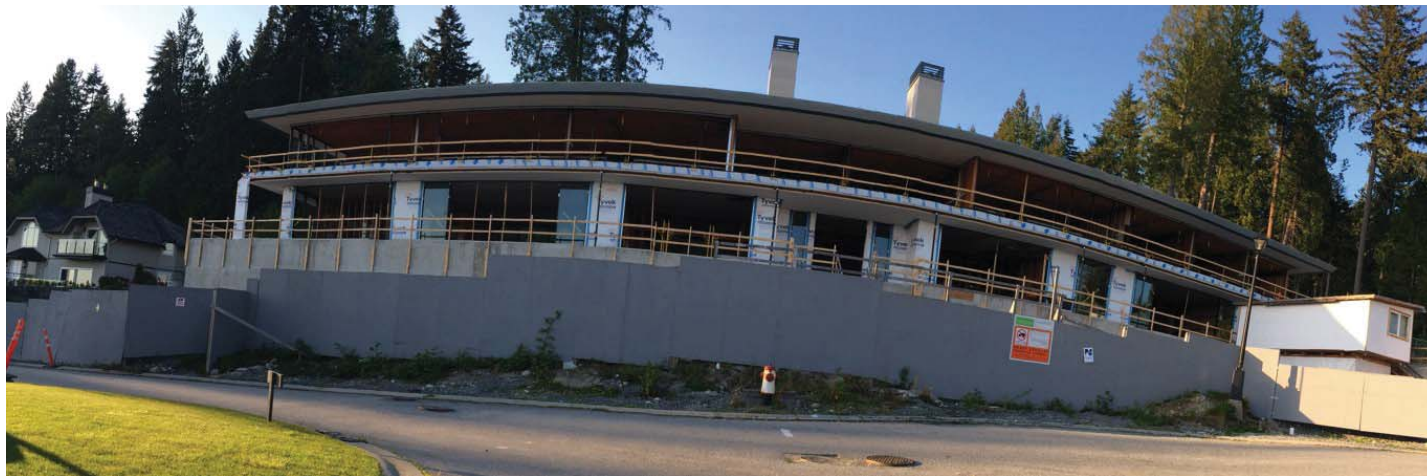
Large single-family residence under construction immediately south of lot 3.