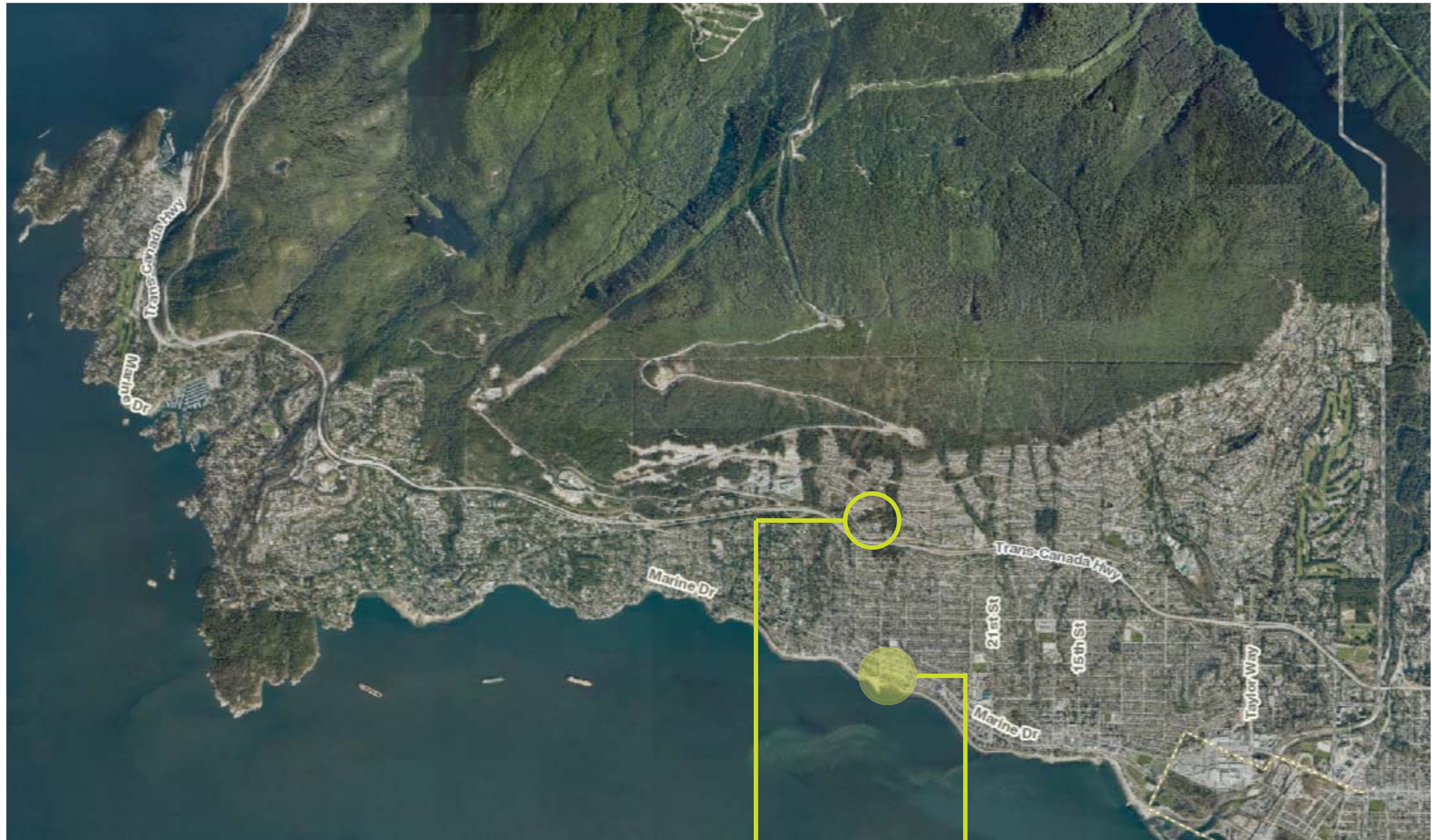
The Site within the District of West Vancouver Context