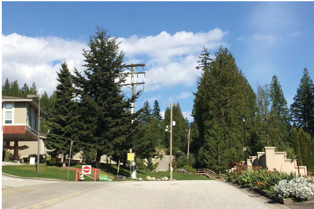
Figure 4 – Unopened Road Allowance from Skilift Road up 25th Street