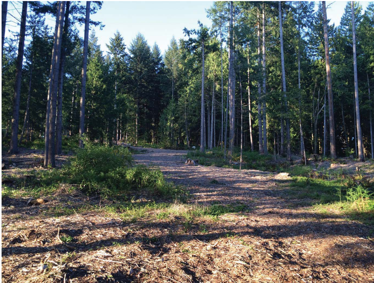
View of Lot 6 looking uphill to the north