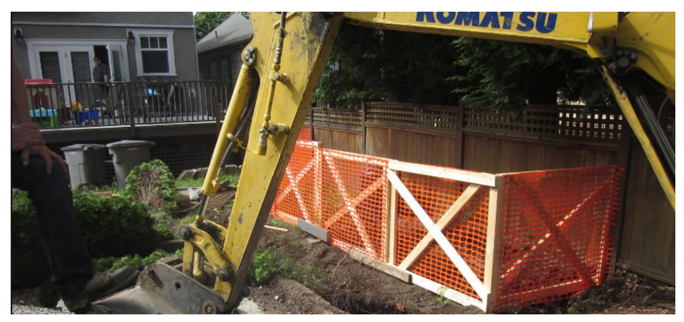
tree fencing—wood framed snow fence