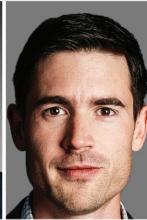
Member of Parliament, Patrick Weiler

As our government prepares Budget 2023, we want to hear from you. With the Canadian economy facing global headwinds and Canadians contending with the impacts of global inflation and elevated interest rates, suggestions received from you through pre-budget consultations will inform measures and investments in Budget 2023 that will help build an economy that works for everyone.