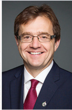
Hon. Minister of Natural Resources, Jonathan Wilkinson