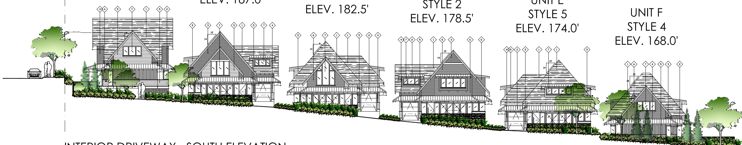
INTERIOR DRIVEWAY - SOUTH ELEVATION