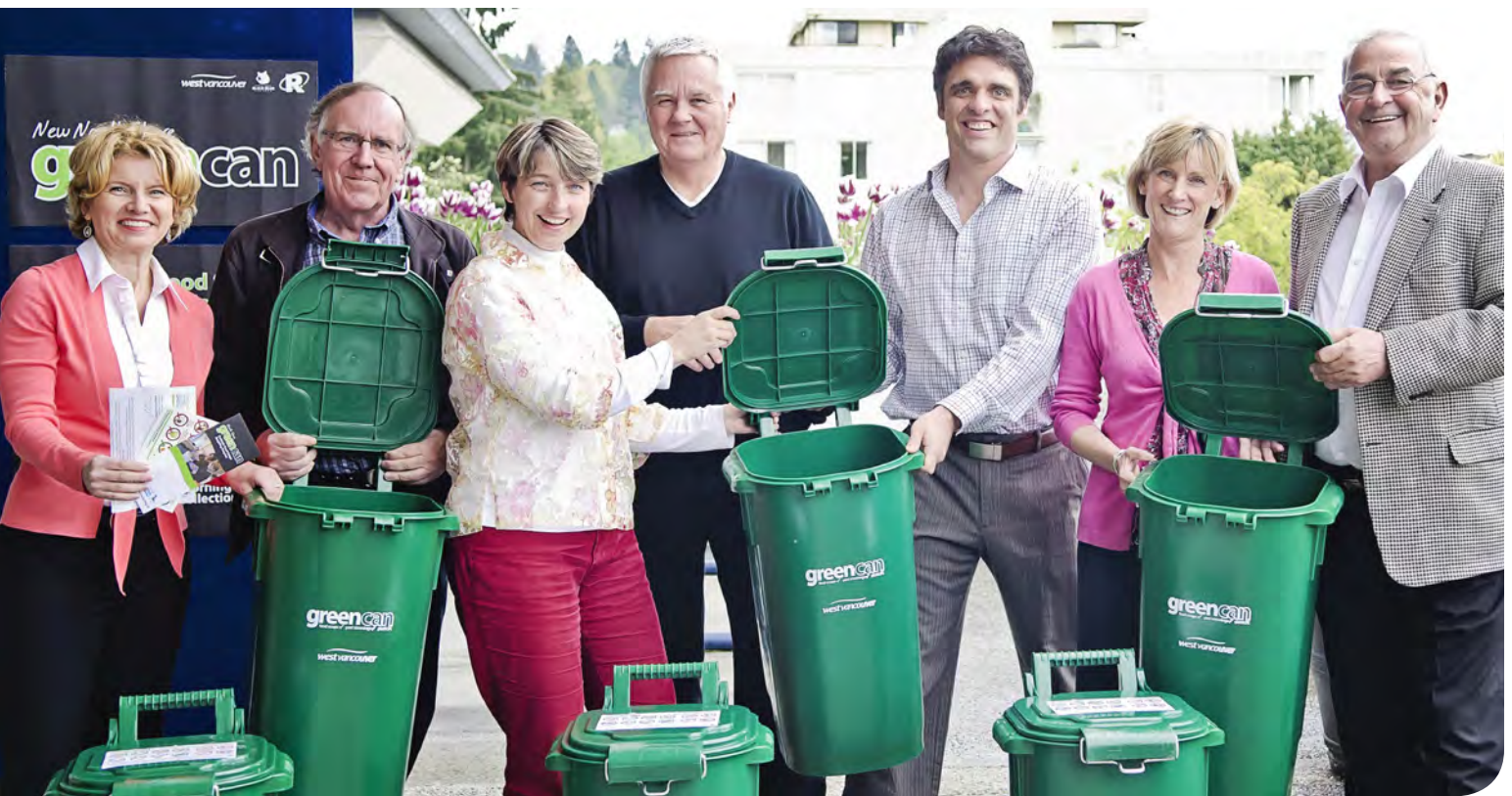
Mayor and Council receiving their green cans.